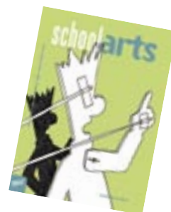
from "Shadow Puppets on a Techno-Stage." See page 42.